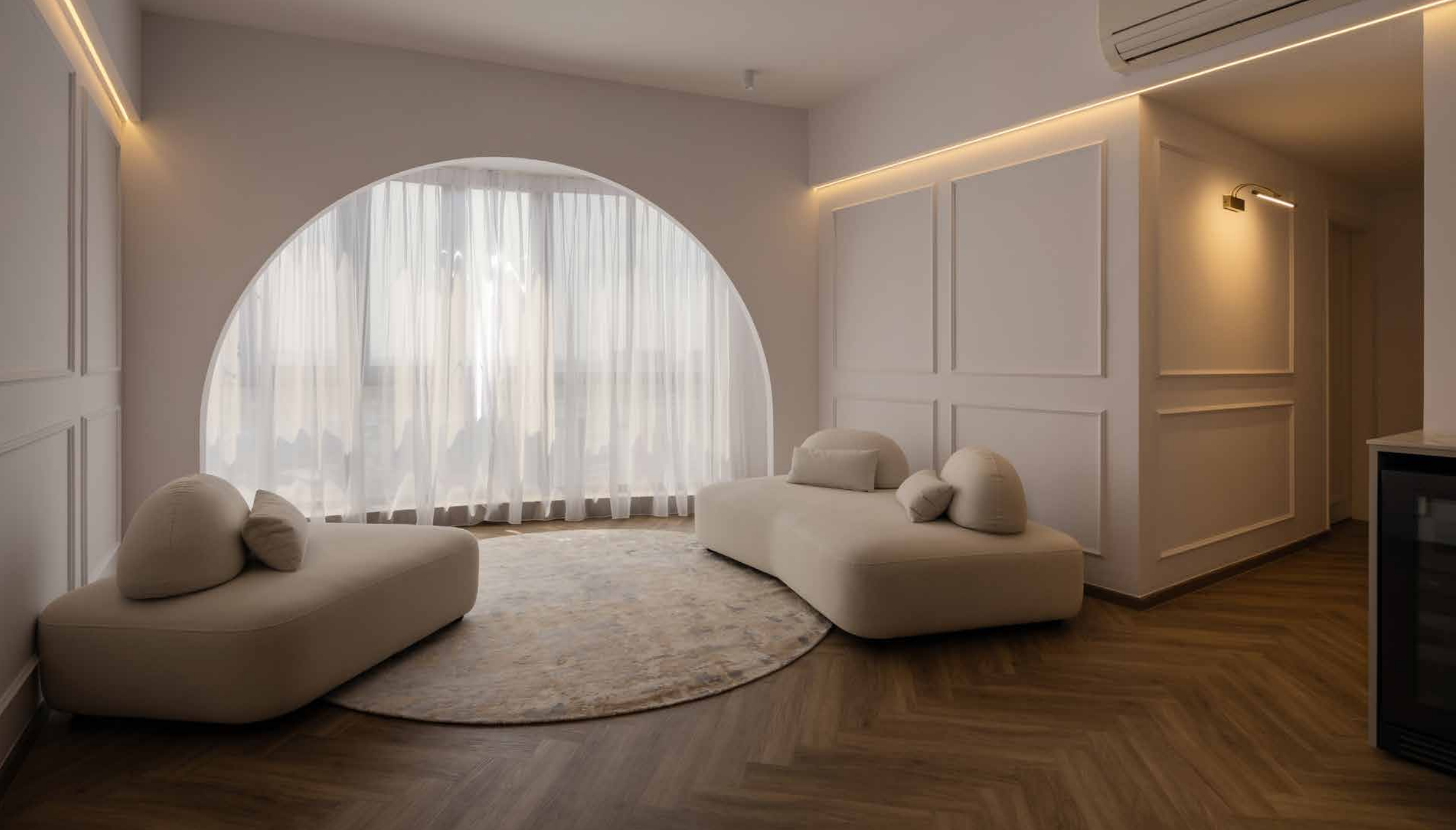
D' INITIAL CONCEPT