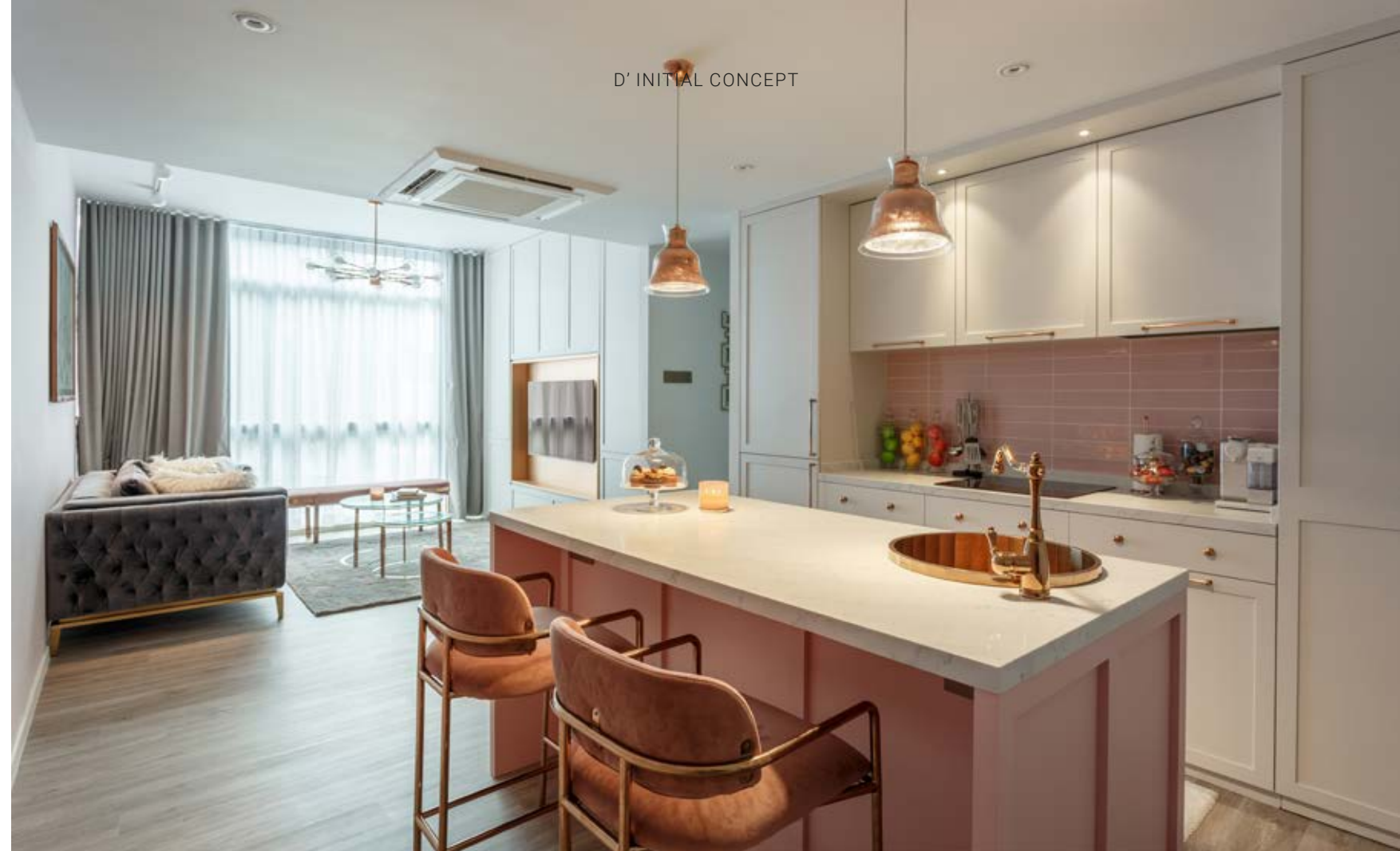
D' INITIAL CONCEPT

Project type: 2+1-bedroom condominium unit — Floor area: 1,250sqft