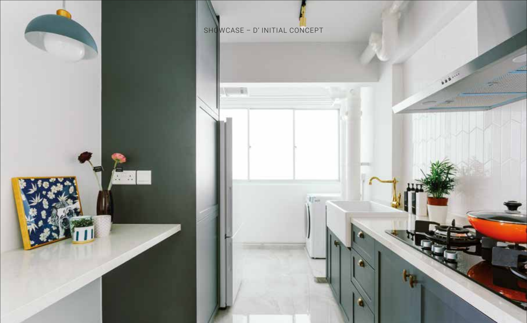
SHOWCASE – D' INITIAL CONCEPT

Project type: 4-room HDB flat — Floor area: 1,281sqft